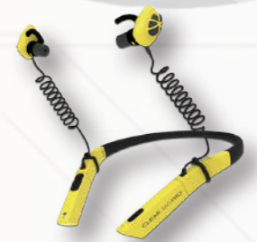
Hearing protection and industrial headsets CLEAR 360 PRO

The sound quality is improved by proprietary acoustic processing technology owned by Bongiovi Acoustics, USA. Many applications are available for different purposes, including the development of solutions for the hearing impaired, disaster prevention, medical care, home appliances, cars, aviation and entertainment. First of all, please experience the greatness of the system with a demonstration.